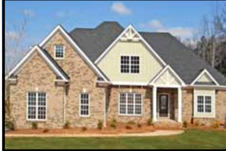
The Reynolds • MLS #883279 • $395,000 378 Arrowpoint Ln, Davidson NC 28036 • 1.15 acre 4BR/3BA + Bonus & Loft • 3287 Sq. Ft-3 Car Garage