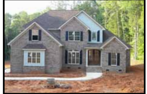
The Charlton • MLS #941061 • $399,000 540 Arrowpoint Ln, Davidson NC 28036 • .93 acre 4BR/3.5BA + Bonus & Loft • 3424 Sq. Ft