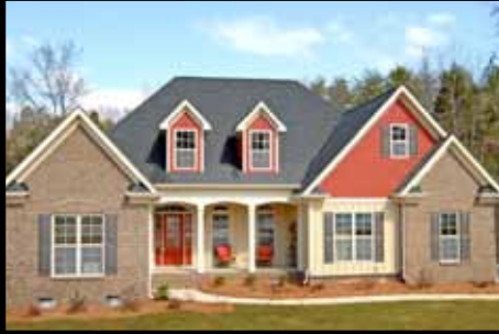
The Walnut Grove • MLS #875063 • $375,000 362 Arrowpoint Ln, Davidson NC 28036 • 1.08 acre 4BR/3.5BA (4th Bonus) • 2813 Sq. Ft-3 Car Garage