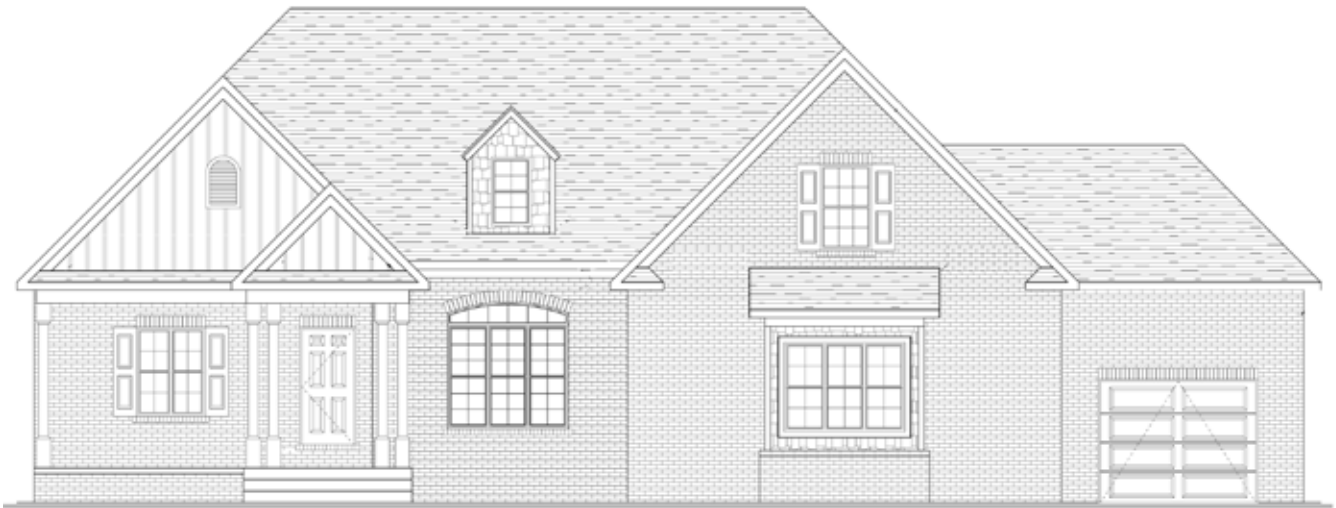
Shown here with optional 3rd car garage.